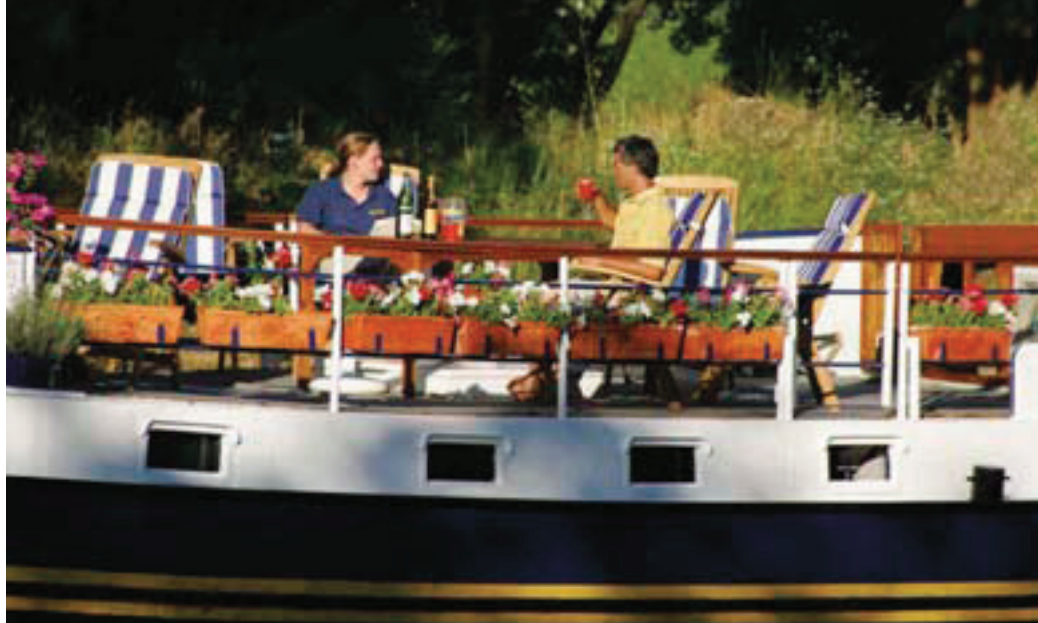
Enjoying conversation and cocktails on board

When the Canal du Midi closes at the end of October, 'Anjodi' cruises in Provence between Avignon and Agde. Contact A&K for details.