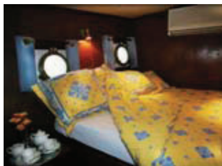
French country décor in 'Anjodi' cabin

Cruise from Marseillan to Portiragnes to visit the old Greco-Phoenician port of Agde. Explore the narrow, medieval streets carved from the Languedocian Hills'