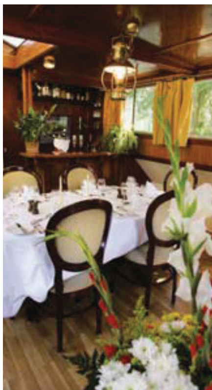
'Anjodi' offers intimate dining