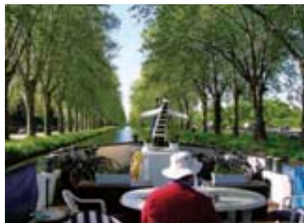
Take in the canal scenery from 'Lorraine'

After a breakfast cruise, visit a crystal workshop to see how the area's most famous products are fashioned by hand. After lunch back on board 'Lorraine,' cruise to Arzviller where a counter-balanced barge lift accomplishes the 150-foot drop in a matter of minutes, allowing barges to