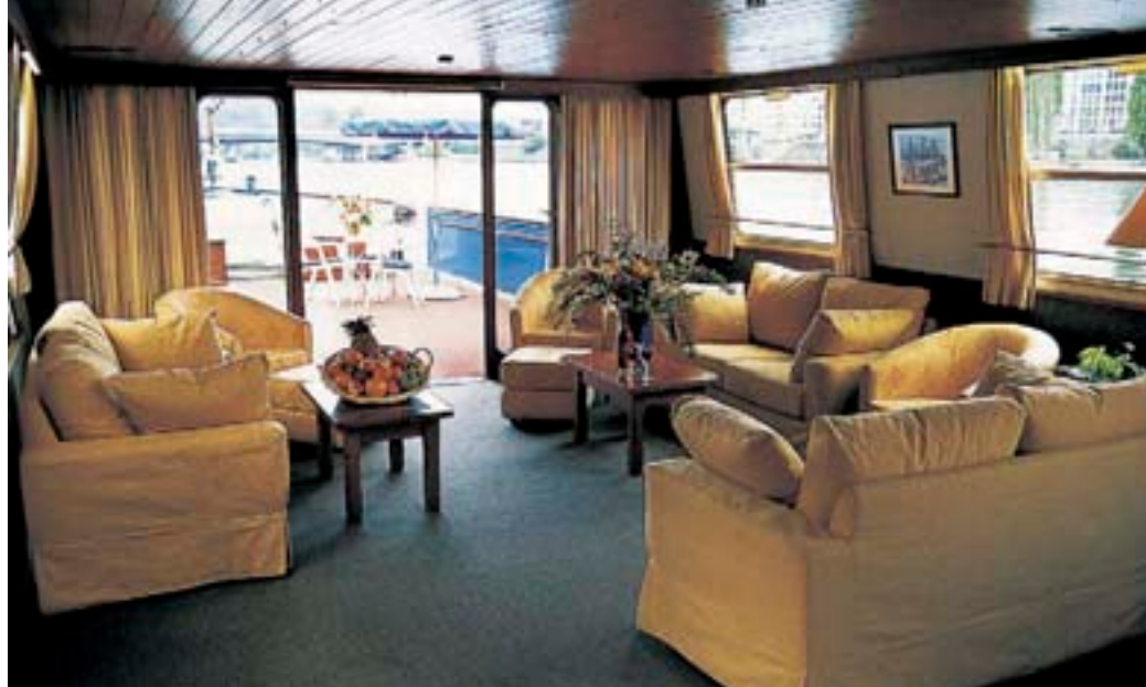
The on-board lounge, with its view on to the deck

Extend your stay with pre- and post-cruise hotel nights. Contact A&K for details and pricing.