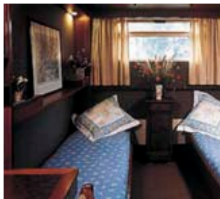
A ‘Lorraine’ cabin