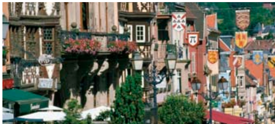
Grand Rue Saverne, Alsace, France