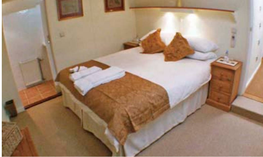
An inviting 'Meanderer' cabin

Upon request, 'Meanderer' can cruise between Rogny-les-Sept-Écluses and Samois-sur-Seine — or between Montargis and Melun. Contact A&K for details.