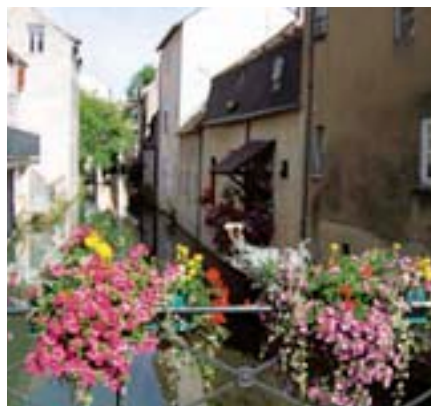
Flowers add a spray of color in Châtillon

'MEANDERER' Length: 123 feet | Width: 17 feet Passengers: 6 | Crew: 4