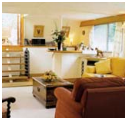
Relax in the sunny lounge