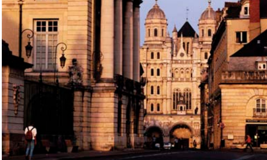
Saint-Michel Church, Dijon

Extend your stay with pre- and post-cruise hotel nights. Contact A&K for details and pricing.