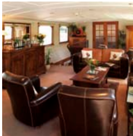
The elegant salon aboard ‘Prospérité’