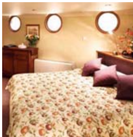
A spacious king suite on board