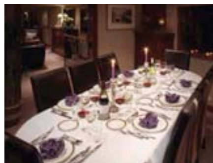
Formal dining aboard 'Prospérité'

Meet at the Paris hotel chosen by the charter group and transfer via chauffeur-driven Mercedes minivan to 'Prospérité,' moored at Dijon. A champagne reception awaits, with time to relax before a first gourmet dinner on board.