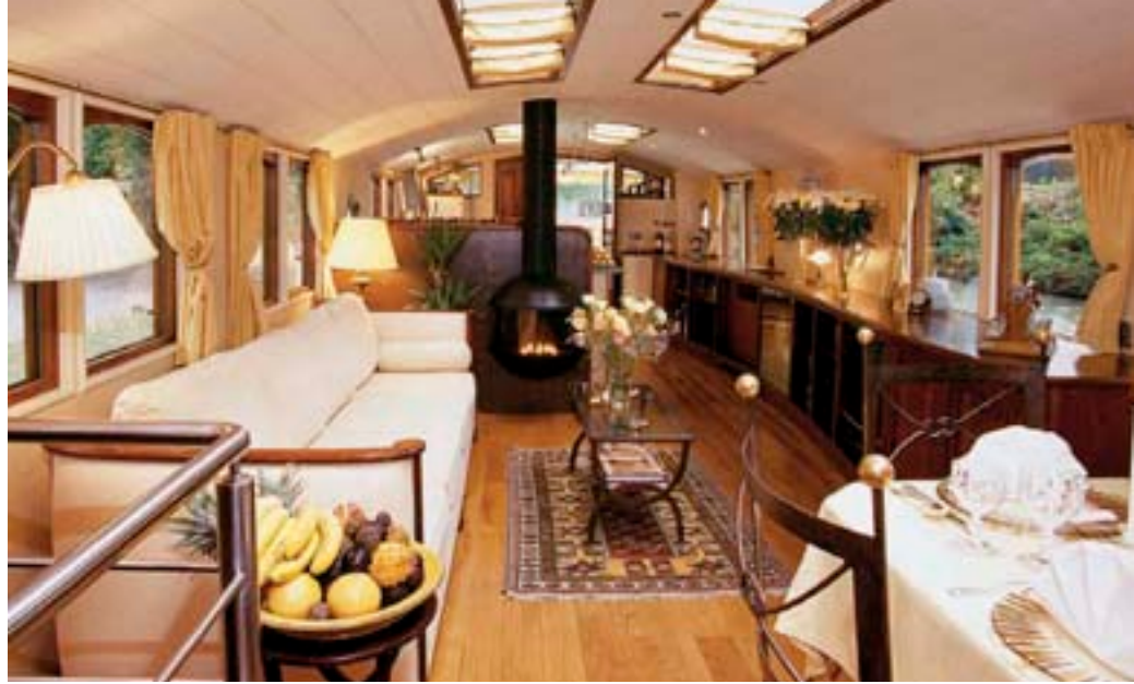
The luxurious lounge aboard ‘Roi Soleil’

In 2009, ‘Roi Soleil’ ventures into Burgundy on a wonderful itinerary between Dijon and Vandenesse-en-Auxois. Contact A&K for details on this exciting new cruise route, with departures from Mar 29 – Apr 26.