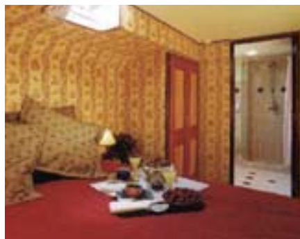
Cabin with en suite bathroom