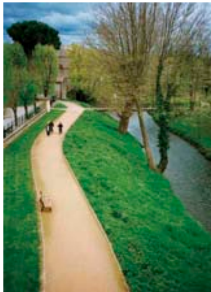
A scenic walk on the ‘Roi Soleil’ route

‘ROI SOLEIL’ Length: 98 feet | Width: 16.5 feet Passengers: 6 | Crew: 4